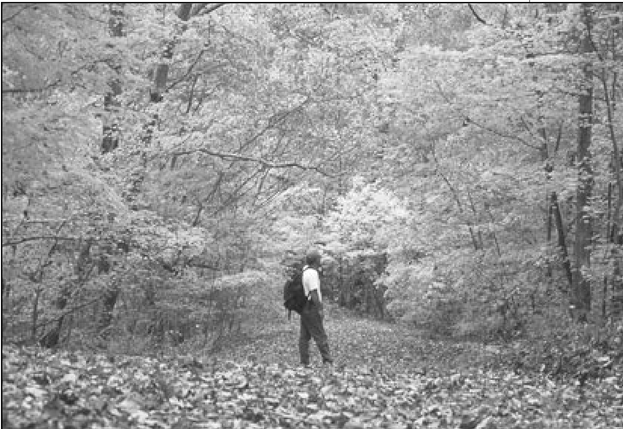
The new federal Healthy Forests Reserve Program has the potential to help protect and restore forestlands through 10-, 30-, and 99-year easements.

The Secretary of Agriculture, in coordination with the Secretary of the Interior and the Secretary of Commerce, will designate forest ecosystems that are eligible for enrollment in the program, which is authorized for fiscal years 2004 through 2008, with an appropriation of $25 million in Fiscal Year 2004. Because the program is so new, there are no examples of funded projects.